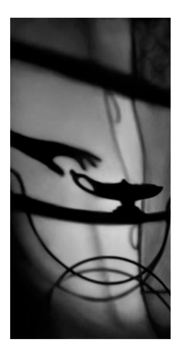
I am the participant and the observer

Night Journey was created and continues to evolve. Grant has undertaken a cycle of shadow works that will number one hundred when complete. The first were cast onto billowing floor-to-ceiling scrims of silk suspended and layered together, breathing one image onto another in an ever-changing shadow world viewers could physically enter. A soundtrack animates the environment: provocative phrases from the sleep lab interrogations uttered in Grant's own voice, loud then soft, words layered like the images, parallel then discordant, edgy clues to the flesh behind the ghostly, ageless silhouettes.